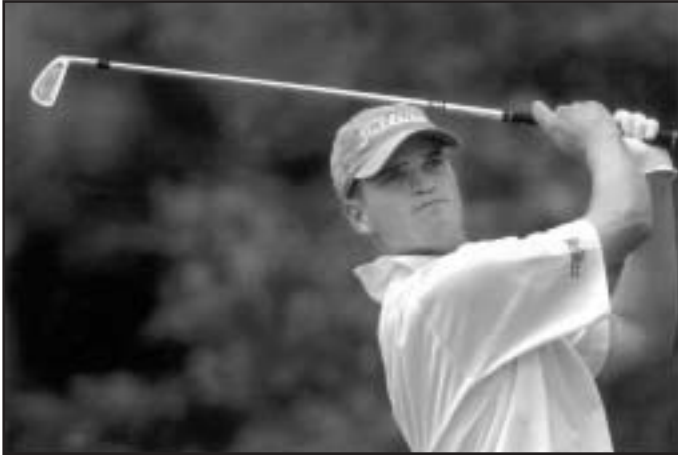
Zach Johnson is a top contender for PGA Rookie of the Year honors.

Zach Johnson (R94) is off to a strong start in his rookie year on the PGA Tour. In fact, 'strong start' may be a bit of an understatement. His win in April 2004 at the Bell South Classic happened on only his ninth event after earning his PGA tour membership. At 28, Johnson has emerged as one of golf's up-and-coming stars.